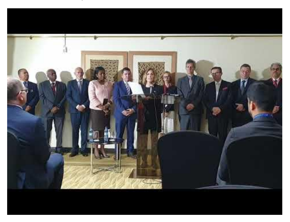
In Wall Street Journal

TCC (as Pro-Life/Family and UN accredited organization) was not welcome at the Nairobi Summit (<a href="http://www.nairobisummiticpd.org/">http://www.nairobisummiticpd.org/</a>) #ICPD25. Like-minded countries, organizations and individuals were, outside official UN-structures, together from 12-14 November to accellerate their wishes/demands to get pro-abortion and pro-comprehensive sexuality education regulations internationally implemented. Therefore we organized a counter conference opposite their place, had a prayer meeting with Kenyan MP's in their Parliament and a great US-led Joint Statement with other like-minded countries, see video and here: