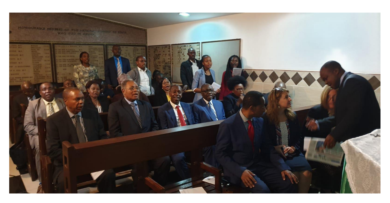
Prayer service with Kenyan parliamentarians in Parliament in Nairobi

(Reformatorisch Dagblad, 13 november 2019)