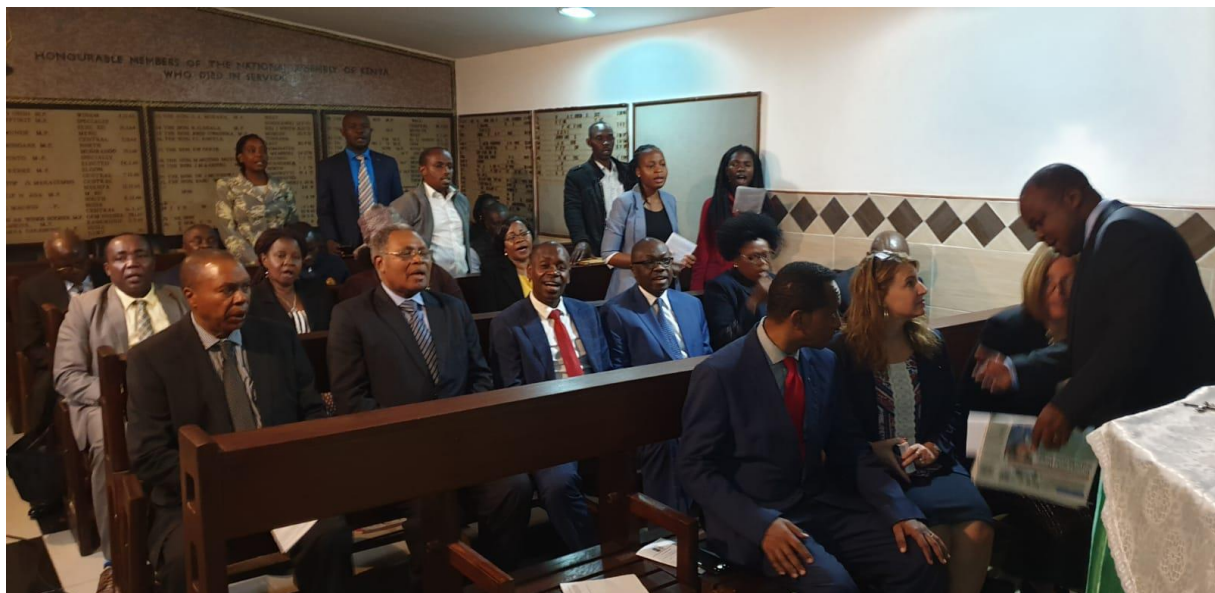
Prayer service with Kenyan parliamentarians in Parliament in Nairobi

(Reformatorsch Dagblad, 13 november 2019)